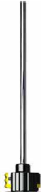
Protective tubes for automotive borescopes