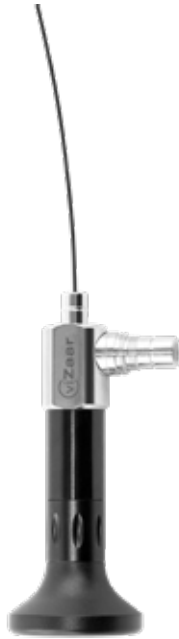
Micro fiberscopes non-articulating