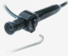
Flexible endoscopes with articulation