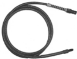
Probe light guides