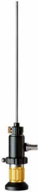
Automotive wide angle borescope