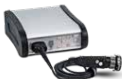
VUVISION-Set with VUHD-CAM