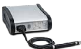
VUVISION-Set with VUSCOPE