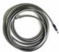
Light guides with stainless steel covering