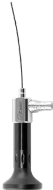
Micro fiberscopes non-articulating