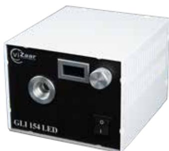
GLI 154 LED